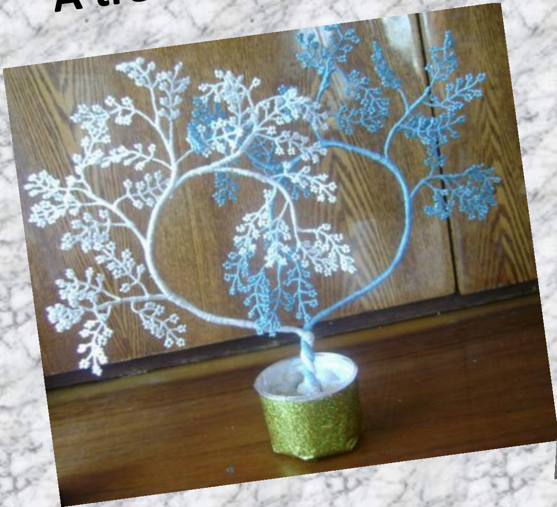
A tree "Love"